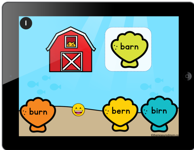
Google Slides presentation